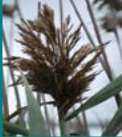
Invasive species - Phragmites

Environmental Protection Agency - Green Acres Fact Sheet