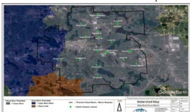
Waterford School District Watershed Map

Recognizing the different watersheds in the area increases opportunities for participation in multiple watershed groups and related activities. Stewardship can be fun, even when we join with groups outside of our community. Learn how different communities protect their watersheds while enjoying kayaking, fishing, or other outings. There are numerous educational opportunities for individuals or groups. It is a great way for children and families to become involved in their community, develop leadership skills, and have fun while helping protect our watersheds.