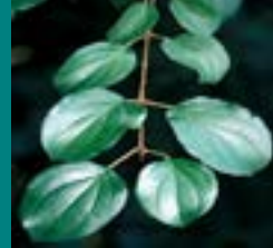
Invasive species - Common Buckthorn