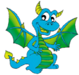
Donelson Hills Elementary