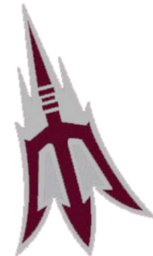
Mason Middle School