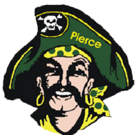
Pierce Middle School